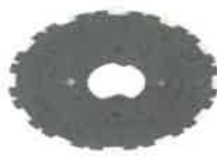
6 X MIDI WHEELS