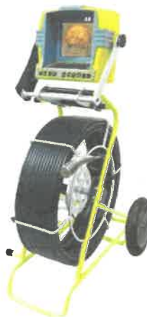
VUTEK PUSH CAMERA