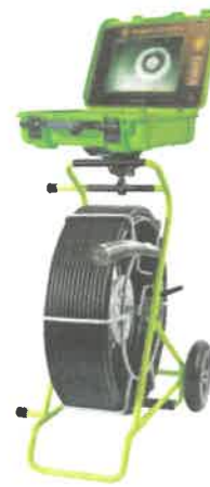
OPTICAM PUSH CAMERA