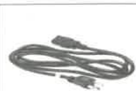
15V POWER CORD